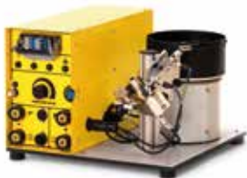
Universal Stud Feed Unit