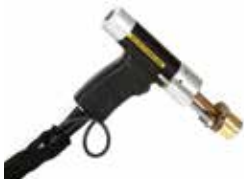
Automatic Pistols Type AP1 and AP2