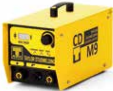
CDM 9 Controller