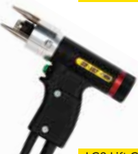
LG2 Lift Gap