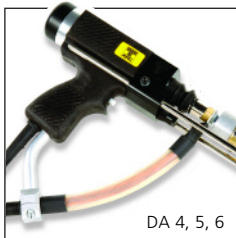
DA 4, 5, 6